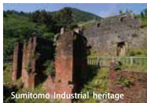
Sumitomo Industrial heritage