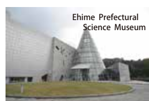
Ehime Prefectural Science Museum