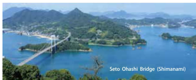
Seto Ohashi Bridge (Shimanami)