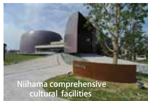
Niihama comprehensive cultural facilities