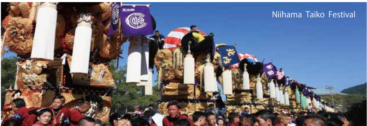
Niihama Taiko Festival